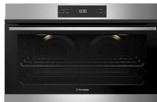
Westinghouse 90cm Electric multi-function 11 oven 125L