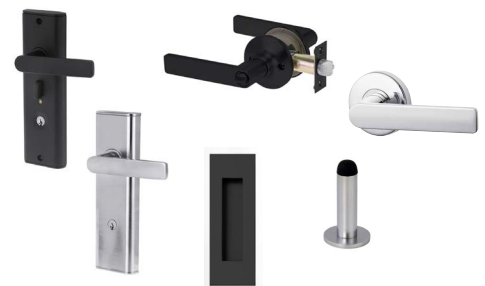
C, SC, MBL