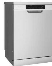
Westinghouse w60cm dishwasher