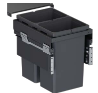
Dual 35L pull-out bin