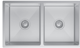
Under mount double bowl stainless steelsink.