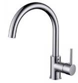
Round Gooseneck to laundry and butlers/WIP C, MBL, BN