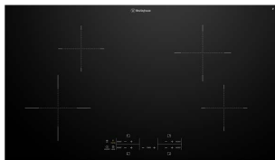
Westinghouse 90cm Gas or induction cooktop