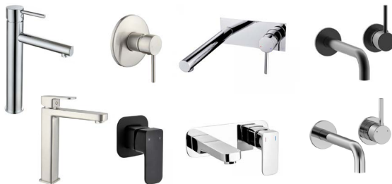
C, MBL, BN