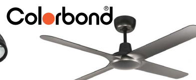
Alfresco ceiling fan in Titanium, Black or White.