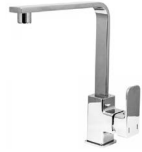
Square Gooseneck C, MBL