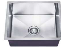
Modern large laundry trough