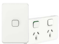
Clipsal Iconic White