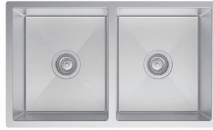
Under mount double bowl stainless steelsink.