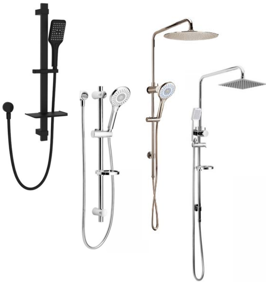
C, MBL, BN