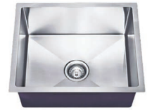
Modern large laundry trough