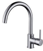
Projix Gooseneck to laundry and butlers/WIP. C, MBL, BN