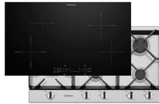
Westinghouse 90cm 4 zone Induction Cooktop WHI943BC OR 5 Burner Gas Cooktop WHG958SC