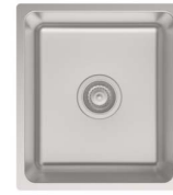
Single bowl or bowl with drainer for WIP/Butlers.