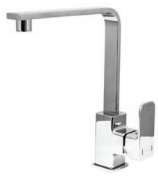
Sigma Square Gooseneck C, MBL