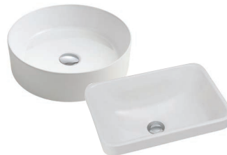
Above counter or inset round or square basins in gloss white with selected finish pop up waste.