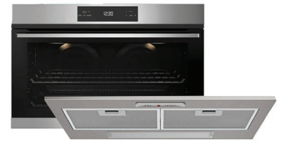
Westinghouse 90cm Multifunction 11 Oven WVE915SCA AND 71cm Integrated Range hood WRI700SB