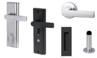
C, SC, MBL