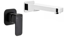
C, MBL, BN